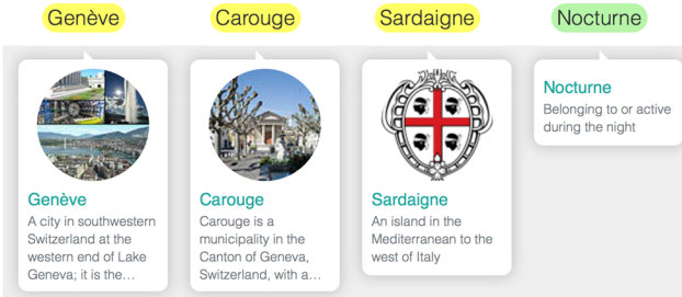
Figure 3. Babelfy disambiguation for photo 3

In Fig. 3 we can see the result of the disambiguation from Babelfy as cited in section 3.1 for the picture 3. We can see the wrong identification (in our context) of the “Sardaigne” tag. In this case the algorithm will select the geo tag identification previously done through GeoNames using the bounding box.