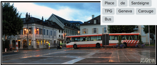
Figure 2. “Place de Sardaigne (Carouge / Geneva)” from X.Com - photo 2

In Fig. 3 we can see the result of the disambiguation from Babelfy as cited in section 3.1 for the picture 3. We can see the wrong identification (in our context) of the “Sardaigne” tag. In this case the algorithm will select the geo tag identification previously done through GeoNames using the bounding box.